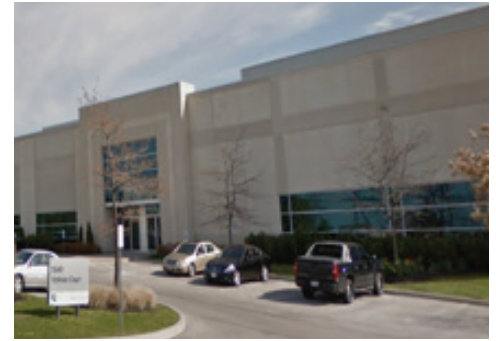
1549 YORKTON BLVD, BURLINGTON, ON

The Fund closed 2017 on a strong note, delivering a robust 2.3% in-quarter performance leading to a total return for the year of 6.3%. The commercial real estate market continues to experience bifurcation. Toronto, Vancouver and Montreal have been propelled forward by ongoing appreciation of institutional quality assets, strong underlying leasing fundamentals, availability of attractive financing, and favorable economic conditions. Alberta, on the other hand, and specifically the Calgary office market, has continued to feel the lingering impacts of the sharp decline in oil prices and the arrival of the last phase of the most recent development cycle. This has resulted in significant vacancy, putting downward pressure on rental rates and, in turn, asset values. The outlook, however, has improved; StatsCan relayed that in December alone the province added 26,000 jobs, of which most were full time, and the price of oil (WTI) closed the year north of $60/barrel. The real estate recovery is certain to lag the overall economy, but tailwinds are emerging. Highlights from the Fund's fourth quarter follow.