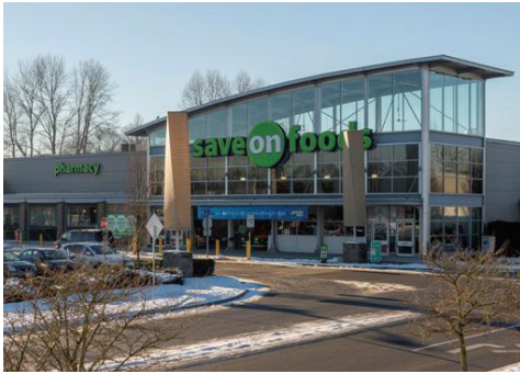
MARINE WAY MARKET, BURNABY, BC