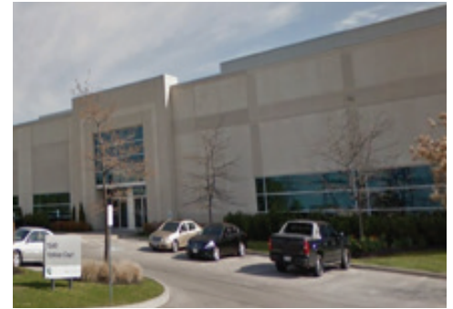
1549 YORKTON BLVD, BURLINGTON, ON

The Fund closed 2017 on a strong note, delivering a 1.5% in-quarter performance leading to a total return for the year of 5.3%. The commercial real estate market continues to experience bifurcation. Toronto, Vancouver and Montreal have been propelled forward by ongoing appreciation of institutional quality assets, strong underlying leasing fundamentals, availability of attractive financing, and favorable economic conditions. Alberta, on the other hand, and specifically the Calgary office market, has continued to feel the lingering impacts of the sharp decline in oil prices and the arrival of the last phase of the most recent development cycle. This has resulted in significant vacancy, putting downward pressure on rental rates and, in turn, asset values. The outlook, however, has improved; StatsCan relayed that, in December alone, the province added 26,000 jobs, of which most were full time, and the price of oil (WTI) closed the year north of $60/barrel. The real estate recovery is certain to lag the overall economy, but tailwinds are emerging. Highlights from the Fund's fourth quarter follow: