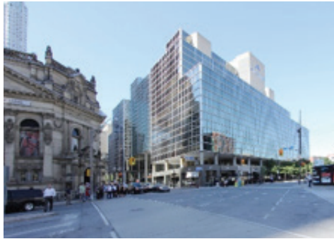
33 YONGE ST., TORONTO, ON