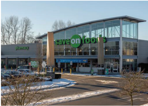
MARINE WAY MARKET, BURNABY, BC