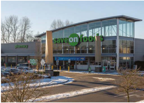
MARINE WAY MARKET, BURNABY, BC