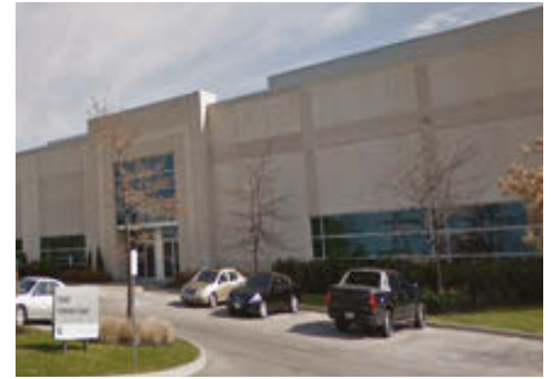
1549 YORKTON BLVD, BURLINGTON, ON

The Fund closed 2017 on a strong note, delivering a robust 2.3% in-quarter performance leading to a total return for the year of 6.3%. The commercial real estate market continues to experience bifurcation. Toronto, Vancouver and Montreal have been propelled forward by ongoing appreciation of institutional quality assets, strong underlying leasing fundamentals, availability of attractive financing, and favorable economic conditions. Alberta, on the other hand, and specifically the Calgary office market, has continued to feel the lingering impacts of the sharp decline in oil prices and the arrival of the last phase of the most recent development cycle. This has resulted in significant vacancy, putting downward pressure on rental rates and, in turn, asset values. The outlook, however, has improved; StatsCan relayed that in December alone the province added 26,000 jobs, of which most were full time, and the price of oil (WTI) closed the year north of $60/barrel. The real estate recovery is certain to lag the overall economy, but tailwinds are emerging. Highlights from the Fund's fourth quarter follow.