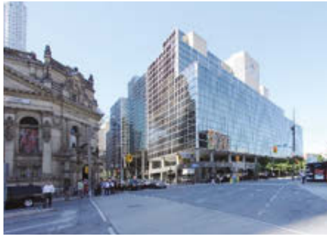
33 YONGE ST., TORONTO, ON