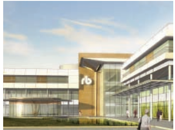
9500 GLENLYON PARKWAY, BURNABY, BC

Breaking ground in November 2007, 65 Lillian is an expansion of 88 Redpath, an existing multi-family asset in Toronto, ON. This second tower comprises 141 suites and will make a total of 327 suites on 1.63 acres of land in a desirable uptown Toronto neighbourhood. Significant