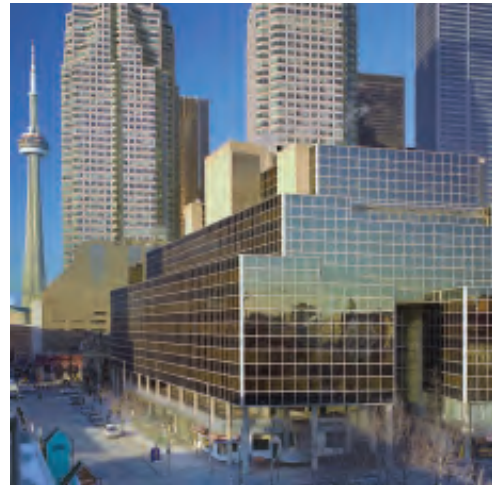
33 YONGE STREET, TORONTO, ON

The Fund's recently constructed 106,000 square foot office building in Mississauga, ON, is 97% leased, as of quarter end. This asset, in which the Fund owns a 50% interest, features leading energy-efficient systems and environmentally friendly design features. Well located, this property is close to major thoroughfares and amenities as well as accessible by public transit. The property's strong tenants will provide the Fund with secure, stable cash flow.