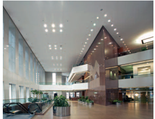
FIRST CANADIAN CENTRE, CALGARY, AB

Seven properties were sold in the quarter for net proceeds of $123.1 million. These included three Alberta industrial buildings, two suburban Toronto office buildings, a parcel of land in Toronto and a suburban Vancouver office building. These sales do not materially affect the weightings of the portfolio by type or region.