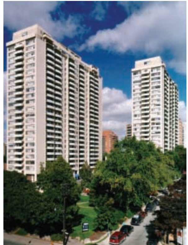
400 WALMER ROAD, TORONTO, ON

The Fund's net operating income from real estate for the first nine months of 2009 was $179.5 million compared to $160.9 million for the same period in 2008. Income growth can be attributed to proactive leasing strategies, rental rate increases for lease renewals and growth of the fund due to acquisitions during 2008. Year-to-date, the