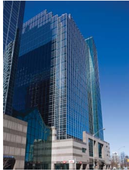
5150-5160 YONGE STREET, TORONTO, ON

The Fund continues to be well-diversified by property type and region and has a sound lease expiry schedule, high-quality assets and strong tenant rolls. It has performed well over many years and will continue to be managed to balance the long-term interest of all Fund participants.