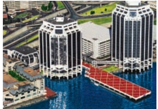
PURDY'S WHARF, HALIFAX, NS

There were no acquisitions in the second quarter of 2009. Activity was focused on the continuing disposition process and on development projects initiated in 2007 and 2008. In the second quarter, the Fund had three dispositions. The first was the sale of a 100% interest in 33 Banner, a 220-unit multi-family asset in Ottawa. This asset was acquired by the Fund in 1998 for $10.4 million and was sold for $22.4 million, which compares favourably to its most recent valuation of $21.0 million.