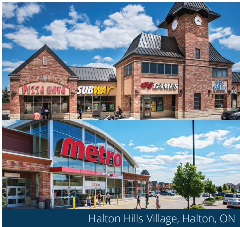
Halton Hills Village, Halton, ON