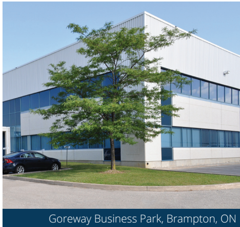
Goreway Business Park, Brampton, ON