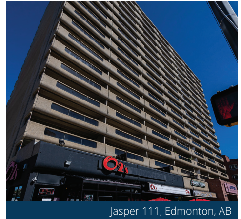
Jasper 111, Edmonton, AB

The Great-West Life Real Estate Fund closed the book on the decade by rewarding investors with its strongest annual performance since 2013. The fourth quarter marked the best period of the year, delivering 270 bps of return, contributing to the 9.1% twelve-month total. Overall performance was derived from a balance between income and capital, as portfolio fundamentals strengthened across the board.