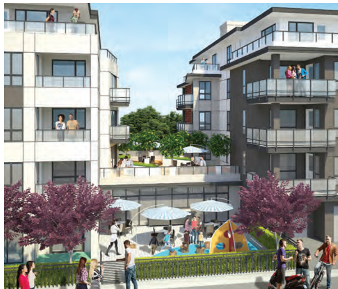
Figure 3 - Rendering of outdoor spaces at 232 East 2nd, North Vancouver

North Vancouver will not have a gymnasium (size of the project is too small); it will have flexible rooms that can be used for yoga, play spaces, meetings and other activities.