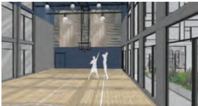
Figure 2 - Rendering of multi-purpose court amenity at Enfield Place

Where GWLRA's new developments especially work for families—and for everyone choosing to rent—is in the amenity offerings. Today many people spend more of their lives in higher density housing. Yet they want the same options more common in ground-oriented homes such as indoor and outdoor play spaces for children (to substitute for a basement rec room and a backyard), an outdoor area to host friends for a barbecue, and even a grand room for a party or an extended family celebratory dinner, plus an exercise room. The latest rental buildings offer these amenities, and much more.