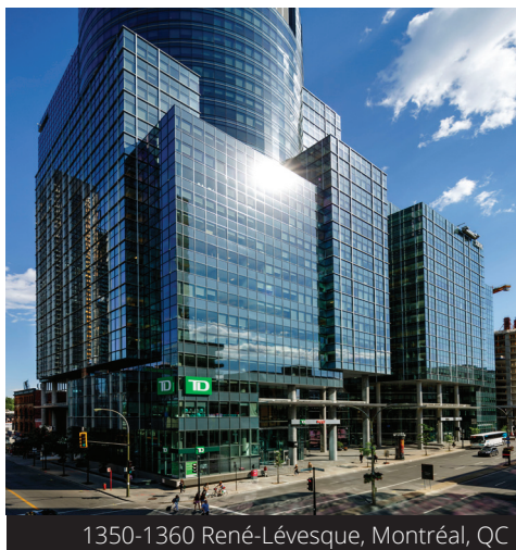
1350-1360 René-Lévesque, Montréal, QC