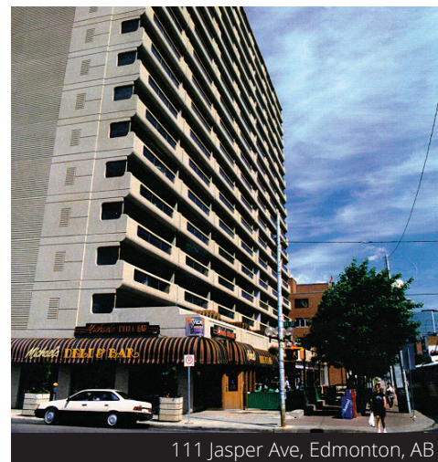
111 Jasper Ave, Edmonton, AB

The London Life Real Estate Fund continued its strong performance through the second quarter of 2019, posting a quarterly gross return of 2.2%, bringing the year-to-date total return to 4.1%. Performance at mid-year signifies a recent highwater mark for the Fund, a threshold unsurpassed since 2013. The capital component of return (200 bps YTD) continues to be led by the Toronto multi-residential and industrial sectors due to a favorable combination of robust investor appetite and regional supply/demand constraints, which are propelling rental rates north. The income story (210 bps YTD) through the second quarter was highlighted by a decrease in the overall portfolio vacancy rate by 125 bps, ending the quarter at 4.9%. A snapshot of second quarter activity for the Fund follows: