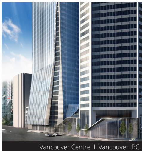
Vancouver Centre II, Vancouver, BC