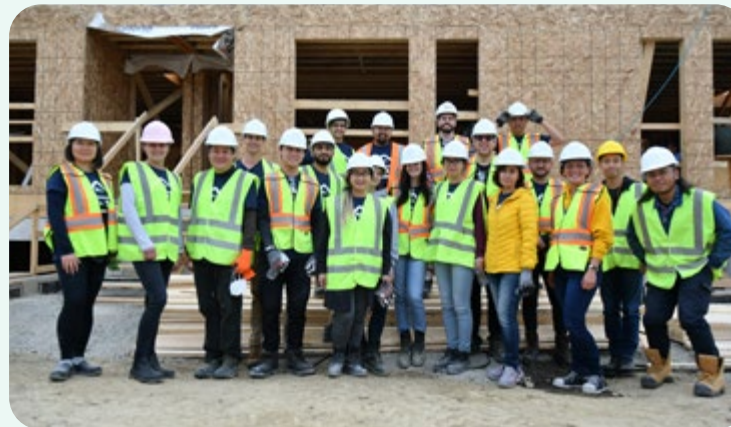
In Toronto, we once again supported our flagship charity partner, Habitat for Humanity, in a five-day build initiative in the city's West End

In addition, we launched a new initiative that encouraged team members to collect and donate gently used sporting equipment to youth in low-income, marginalized or remote communities. Initial feedback has been overwhelmingly positive, and we have had an immediate impact on communities across Canada including the Tataskweyak Cree Nation, a remote community of 3,700 people located 13 hours north of Winnipeg. Receiving the donated sports equipment means more youth in this community are able to enjoy the rewarding benefits of sport and physical activity.