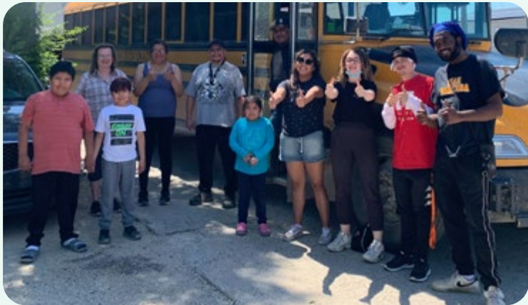
Across the country, we collected and donated gently used sporting equipment to youth in low-income, marginalized or remote communities