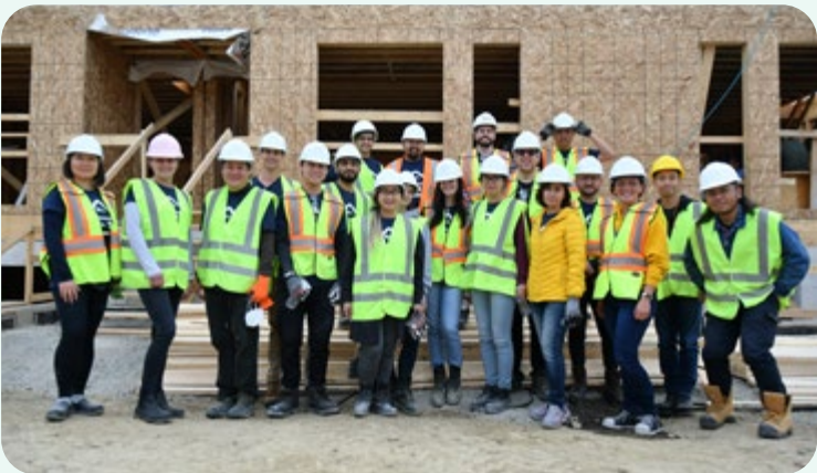
In Toronto, we once again supported our flagship charity partner, Habitat for Humanity, in a five-day build initiative in the city's West End