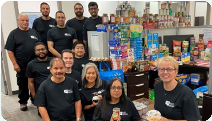
Together with tenants, the BC Suburban Group participated in a food drive that collected over 1,000 items

In addition, we launched a new initiative that encouraged team members to collect and donate gently used sporting equipment to youth in low-income, marginalized or remote communities. Initial feedback has been overwhelmingly positive, and we have had an immediate impact on communities across Canada including the Tataskweyak Cree Nation, a remote community of 3,700 people located 13 hours north of Winnipeg. Receiving the donated sports equipment means more youth in this community are able to enjoy the rewarding benefits of sport and physical activity.