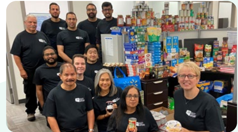
Together with tenants, the BC Suburban Group participated in a food drive that collected over 1,000 items