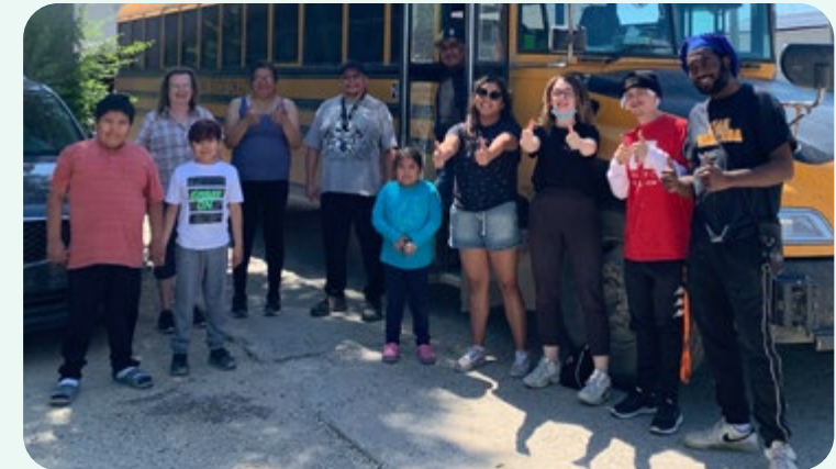
Across the country, we collected and donated gently used sporting equipment to youth in low-income, marginalized or remote communities